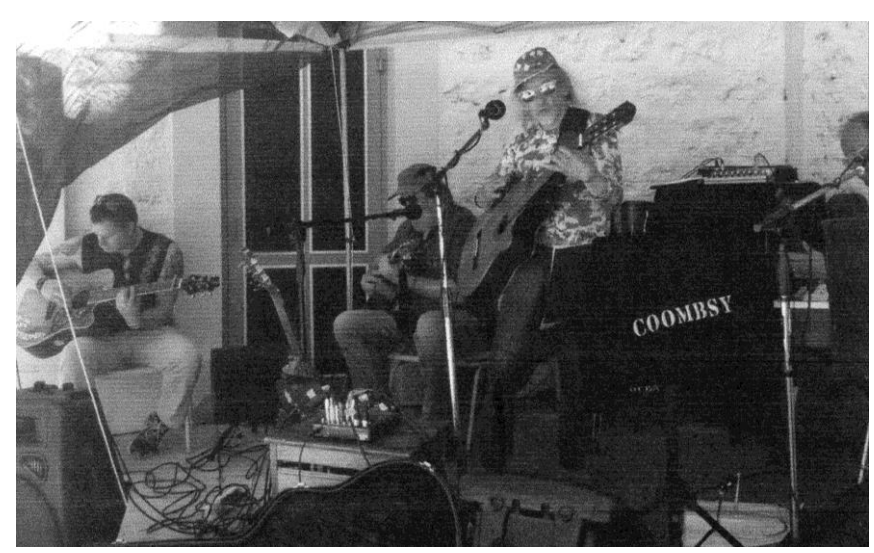
Music at the Monthly Market

Our first WORKING BEE for a while ON SATURDAY MORNING, June 30th 9.00 am to 1.00 pm Cleanup, Weed control & Pruning At the Butter Factory