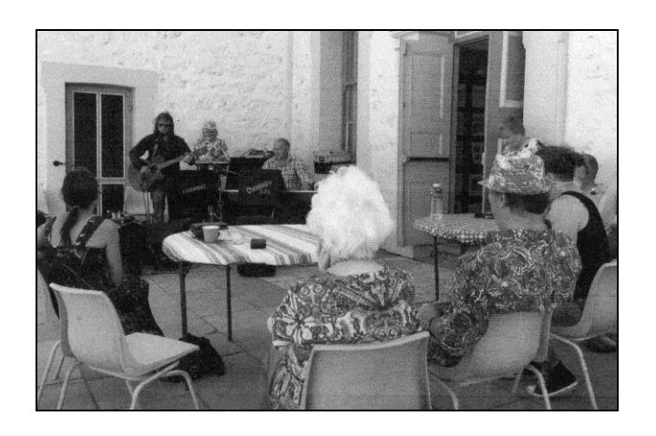
Enjoy the music with a cup of coffee